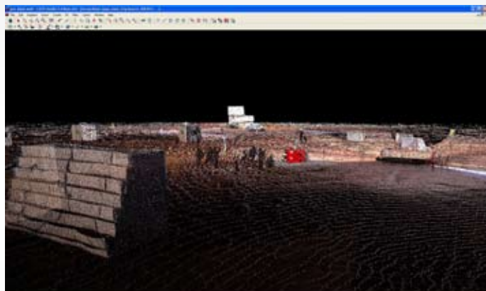
Scan data of the site before the blast in true photographic colour

The accuracy and high volume of data collected with I-SiTE's 4400 laser scanner makes it an ideal system for surveying blast sites. When combined with the powerful modelling and scan interrogation capabilities of I-SiTE Studio, the I-SiTE 4400 laser scanner provides investigators with abundant data for analysis.